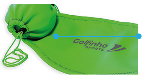
Single piece, without seams, ensuring greater durability. Includes 2 pvc balls.